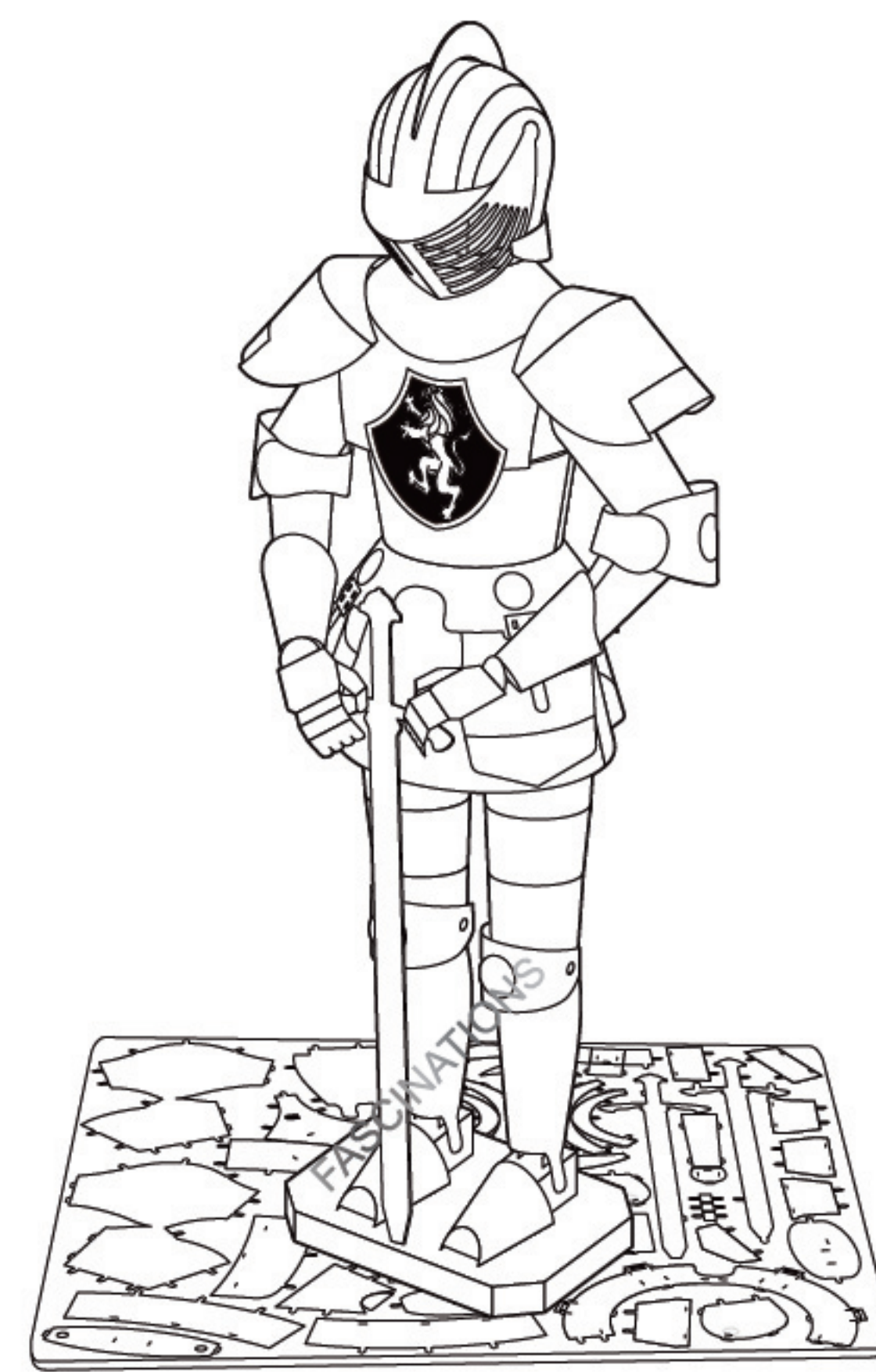
European Armor Item No. MMS142